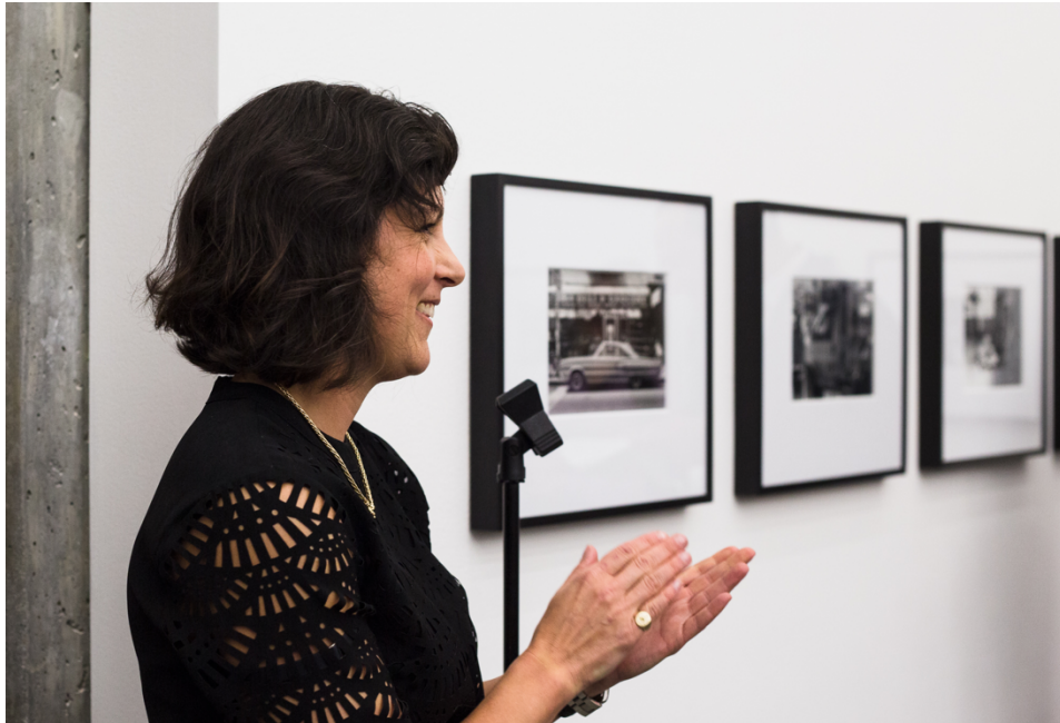
2017 Festival Launch at Contemporary Art Gallery.