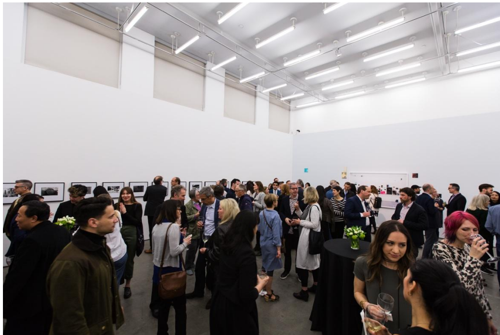
Song of the Open Road, opening night, April 1, 2017.