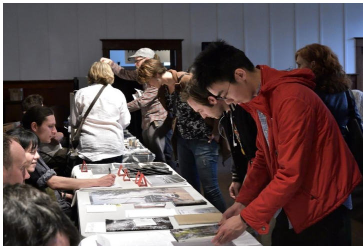
Vancouver Photo Book Fair at the Western Front.

The VPBF attracted more than 500 attendees to view the works of 24 exhibitors and attend two workshops and four talks, over three days at the Western Front and James Black Gallery. It was organized in partnership with the Vancouver Art Book Fair (VABF), the longest-running international art book fair in Canada, which takes place every October at the Vancouver Art Gallery.